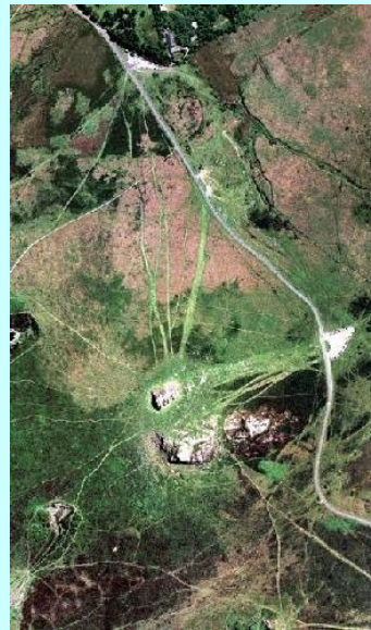
Satellite photo of Haytor