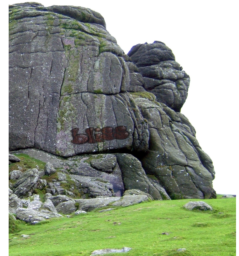
Graffiti on Haytor